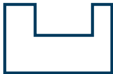
25 x 16 Section

HU-SL/LO Face fix & through frame reveal fix